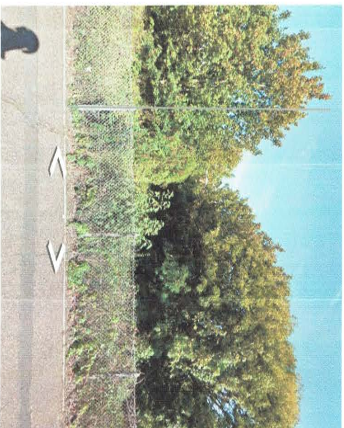
LOCATION A WITH POLE

DESCRIPTION: A 5.5-metre high, 69dia pole at the rear of the footpath adjacent to the first concrete chain-link fence post west of the pedestrian guard rail with a wire crossing East Street to a matching pole adjacent to the fence at the rear of the footpath directly opposite Pole A.