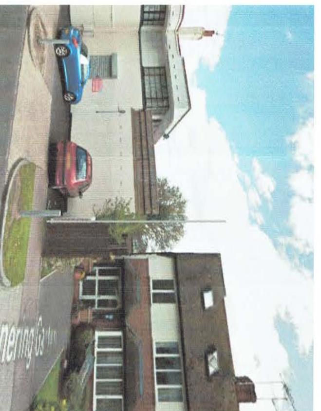
LOCATION B WITH POLE