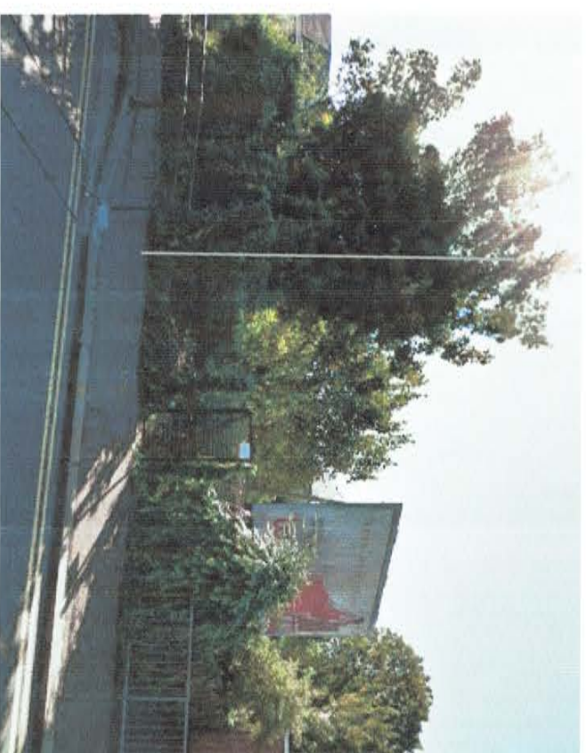
LOCATION B WITH POLE