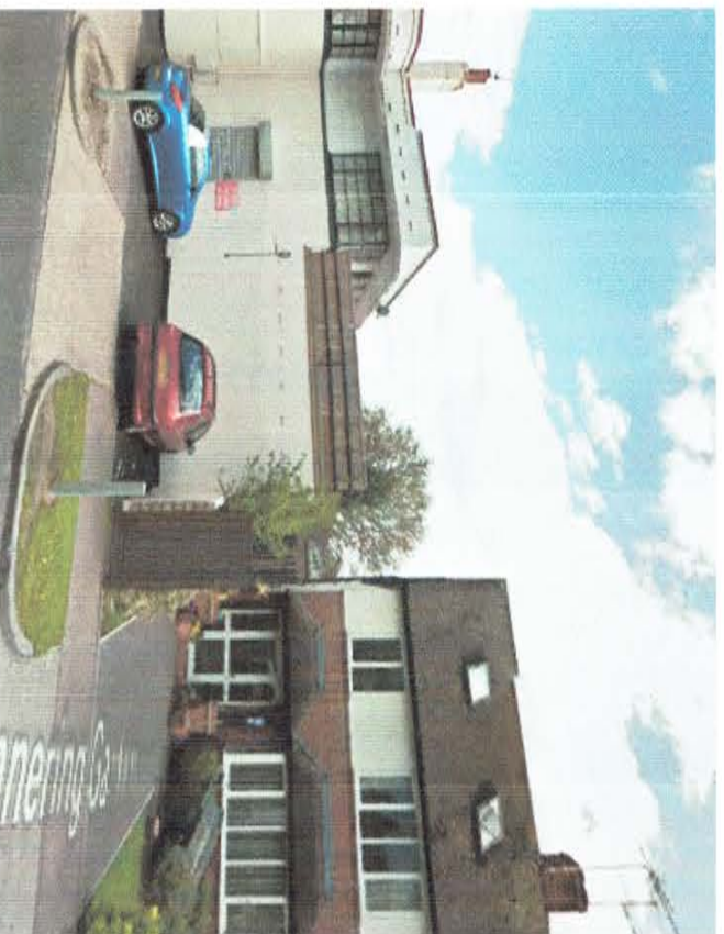
LOCATION B WITHOUT POLE

DESCRIPTION: A 5.5-metre high, 89dia pole at the rear of the footpath in front of the end fence post to the south side of the path to the north of 61 Mannering Gardens with a wire crossing to a matching pole in front of the end of the rendered brick wall between 56 Mannering Gardens and 60 Bridgewater Drive.