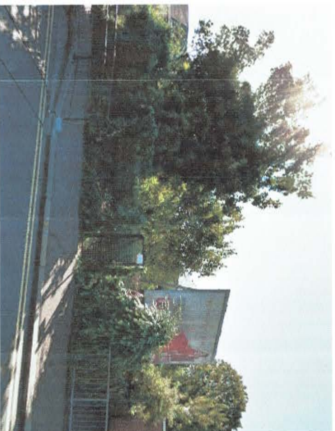
LOCATION B WITHOUT POLE

DESCRIPTION: A 5.5-metre high, 69dia pole at the rear of the footpath adjacent to the first concrete chain-link fence post west of the pedestrian guard rail with a wire crossing East Street to a matching pole adjacent to the fence at the rear of the footpath directly opposite Pole A.