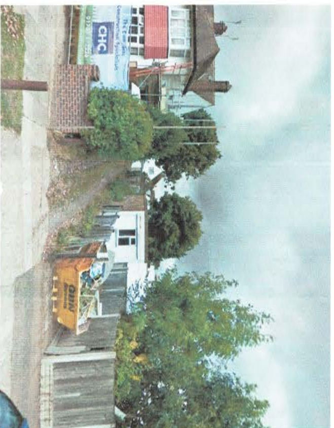
LOCATION A WITH POLE

DESCRIPTION: A 5.5-metre high, 89dia pole at the rear of the footpath in front of the end fence post to the south side of the path to the north of 61 Mannering Gardens with a wire crossing to a matching pole in front of the end of the rendered brick wall between 56 Mannering Gardens and 60 Bridgewater Drive.