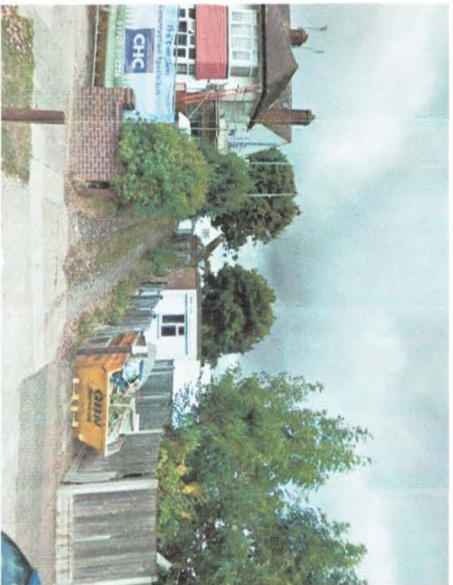
LOCATION A WITHOUT POLE